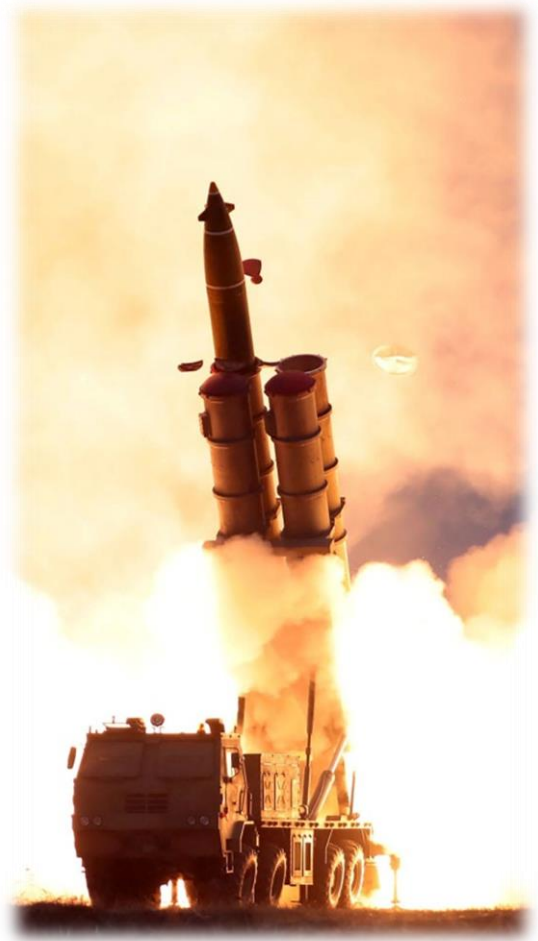
North Korean Missile Test

The U.S. military in South Korea said that one of the main mission areas that the space unit in South Korea will focus on is “missile warning operations, which provides in-theater near-real-time detection and warning of ballistic missile launches.” It said the new unit’s tasks also includes coordinating space operations and services such as position navigation and timing, and satellite communications within the region. ★