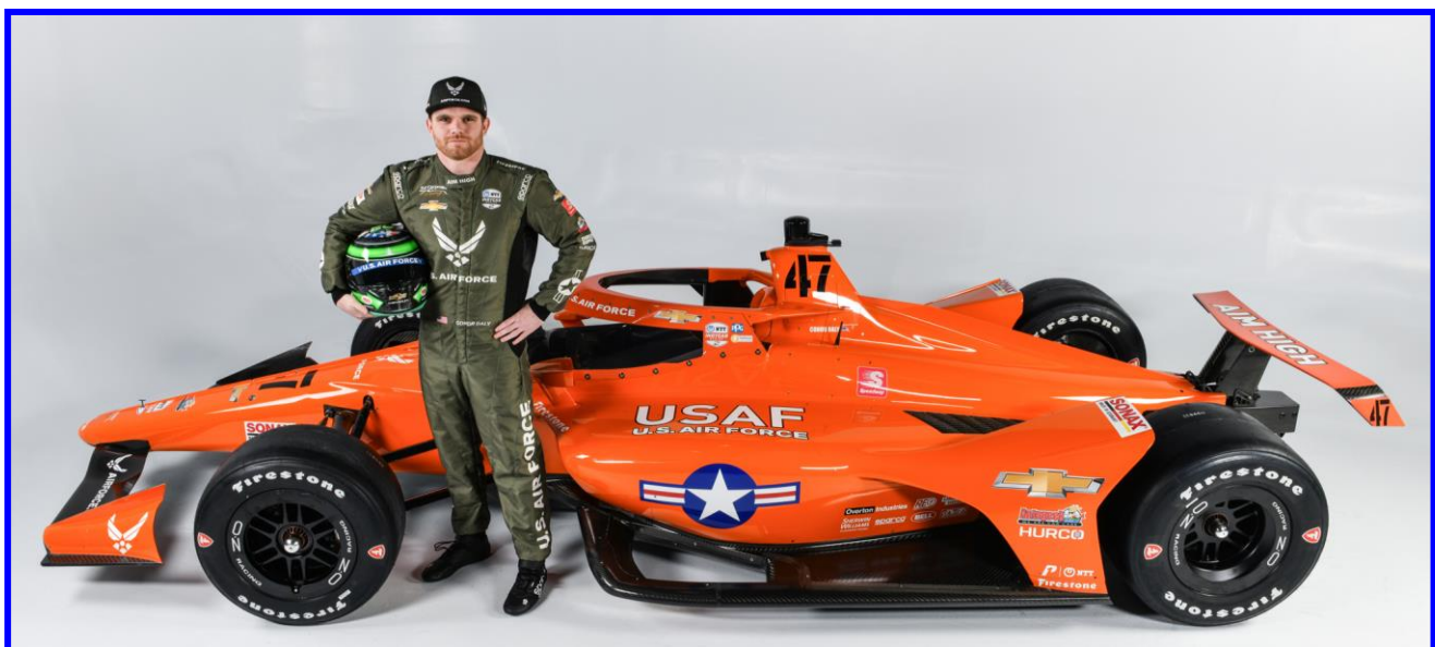
Design of Daly’s No. 47 Pays Tribute to Chuck Yeager’s “Glamorous Glennis” Aircraft

The No. 47 selected for Daly’s car has double significance. The U.S. Air Force was officially founded on September 18, 1947 with the passage of the National Security Act of 1947. That legislation would separate the U.S. Air Force from the U.S. Army and allow the U.S. Air Force to become a separate branch of military service. Less than a month later, on October 14, 1947, an experimental U.S. Air Force rocket plane became the first crewed aircraft to exceed the speed of sound.