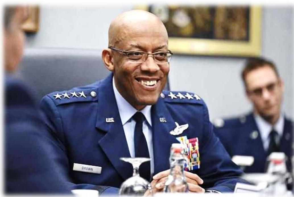
Gen. CQ Brown, Jr. Chief of Staff of the United States Air Force

I appreciate your being a member of the West Coast Chapter and urge you to reach out in any way possible to help our Air and Space Forces to maintain the capabilities they have today and to continue to provide for our Nation's defense.