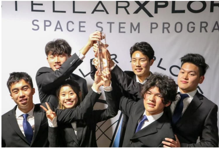
2022 Champions: Team Panther #3 from Palos Verdes Peninsula High School in Rolling Hills Estates, Calif.

U.S. space industry, space-focused academia, and government entities, the Air Force Association (AFA) developed the StellarXplorers Program